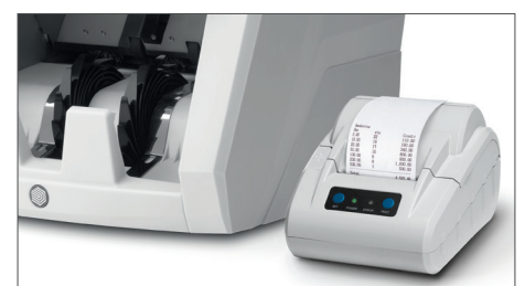
Print the count results instantly on the Safescan TP-230 printer