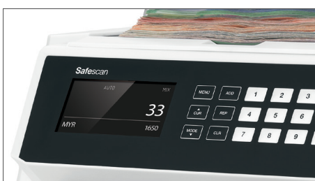
Automatic currency and denomination recognition