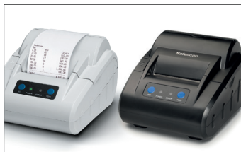
Safescan TP-230 Thermal printer Art. no: 134-0475 grey Art. no: 134-0535 black