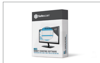
Safescan MCS Software Art. no: 124-0500