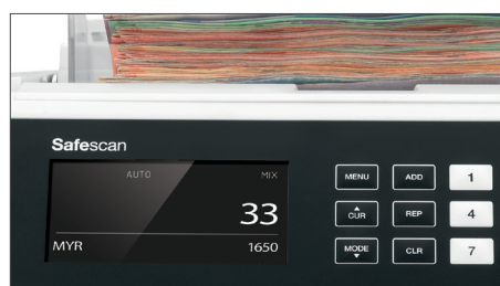
Counts unsorted banknotes for: MYR, HKD, USD, EUR, GBP, CAD, MXN, CNY, SGD, JPY