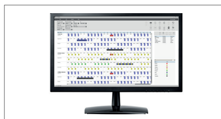
TimeMoto desktop software for single PC use included