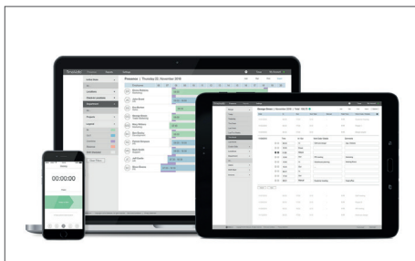
TimeMoto Cloud / TimeMoto Cloud Plus Art.no: 139-0612 / 139-0613