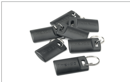
TimeMoto RF-110 set of 25 RFID key fobs Art.no: 125-0604