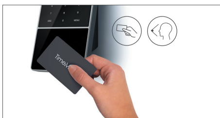
Clocking with RFID proximity card, Face recognition or PIN code