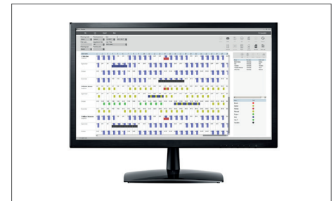
TimeMoto PC Software Plus Art.no: 139-0602