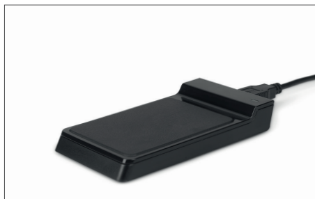
TimeMoto RF-150 USB RFID Reader Art. no: 125-0605