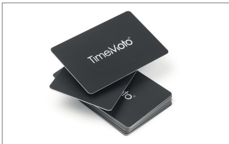
TimeMoto RF-100 set of 25 RFID badges Art. no: 125-0603