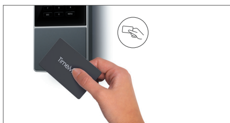
Clocking with RFID proximity card or PIN code