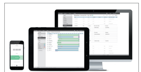
Or TimeMoto Cloud (30 days included)