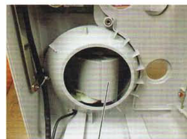
New Generation Coin Feeding System