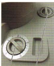
Coin Thickness Adjustment Coin Diameter Adjustment