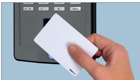
WITH FINGERPRINT AND RFID BADGE READER