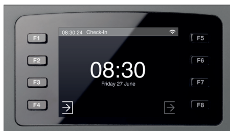
USER-FRIENDLY GRAPHICAL INTERFACE