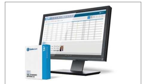
Safescan TA+ software Art.no: 125-0516