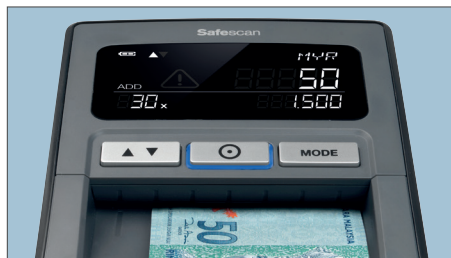
SHOWS VALUE AND TOTAL AMOUNT OF THE SCANNED BANKNOTES