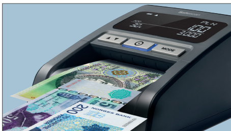
VERIFIES UP TO 8 CURRENCIES