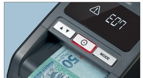
COUNTERFEIT BANKNOTE ALARM