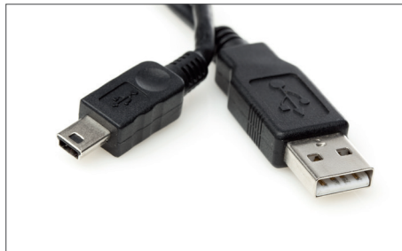
Safescan USB update cable Art. no: 112-0459