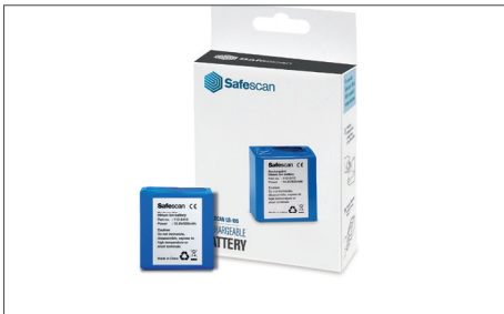
Safescan LB-105 Rechargeable battery Art. no: 112-0410