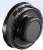
Keyless Combination Lock