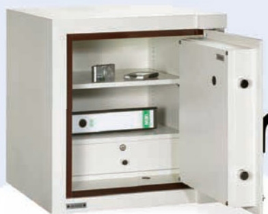
Mini Banker Size 4