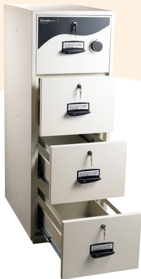
4 Drawers RPF Cabinet comes with Individual Locking

The RPF Cabinet is placed inside a furnace and heated to 1010°C for 2 hours (5200 series) and is left to 'soak-out' to simulate an 'after fire' environment. The Cabinet has been designed to limit the internal temperature to not more than 177°C.