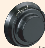
Keyless Combination Lock