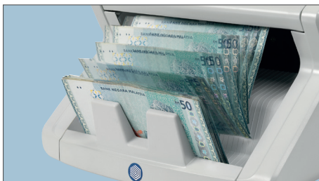
HIGH-SPEED COUNTING OF SORTED BANKNOTES